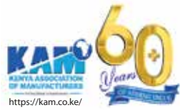
Kenya Association of Manufacturers